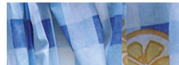
Curtains included 6 Blue squares